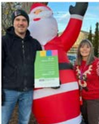
Hatfield Electric - Lighting Donation