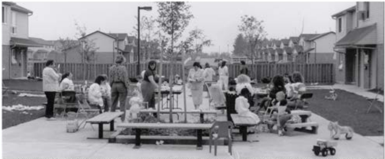
Staff and Resident Spring BBQ – circa 1990 (includes participants of Pre-Employment Training Program now known as WERC)