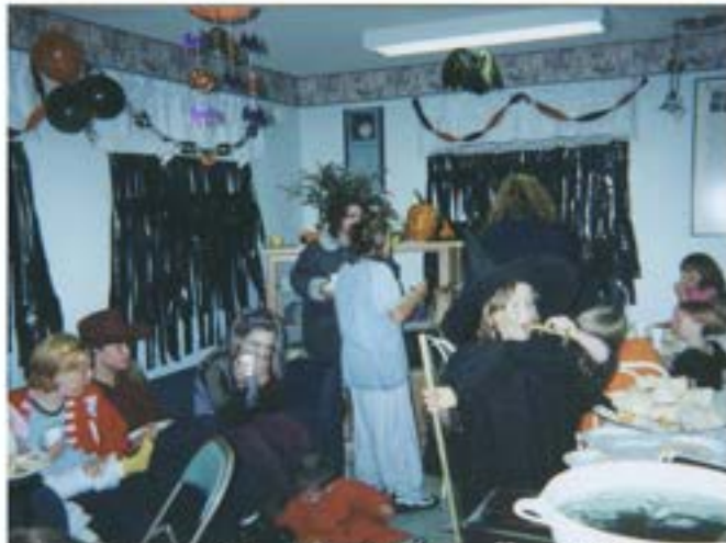
Halloween Resident/Staff Party – circa 1991