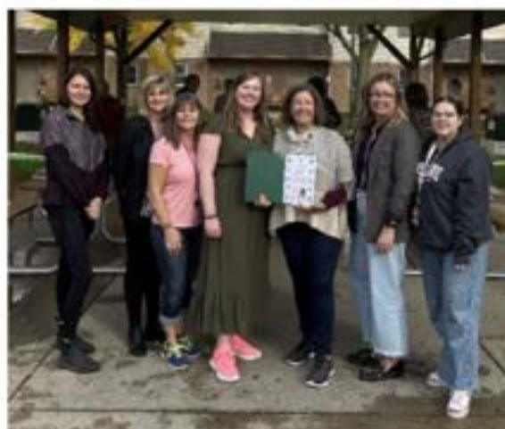
Trillium Fund Gazebo Opening