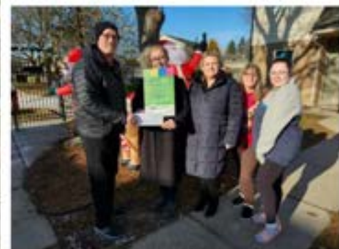
UNIFOR Local 636 - Christmas Donations