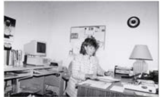
starting out as Executive Assistant – circa – January, 1990

Over the past 34 years working with Ingamo Homes, I have had the distinct pleasure of meeting many courageous women, with and without children, seeking to rebuild their lives free from intimate partner violence. Ingamo Homes provides rent-geared-to-income (RGI) affordable housing along with a range of supports tailored to meet the unique needs of each woman and her family.